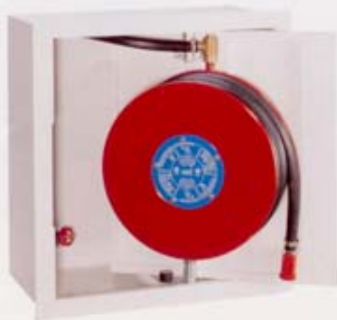
MODEL C SINGLE COMPARTMENT PIVOT TYPE HOSE REEL CABINET