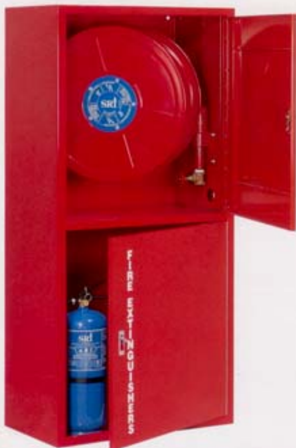
MODEL A DOUBLE COMPARTMENT HOSE REEL CABINET