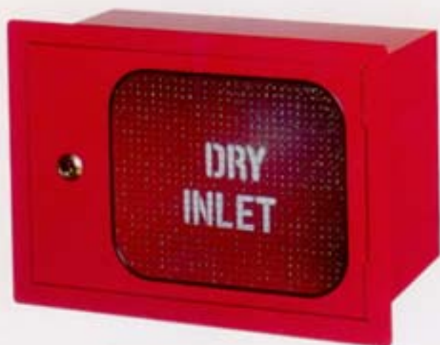
2 WAY BREECHING INLET CABINET