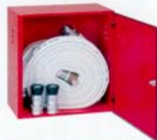
MODEL D HOSE CABINET