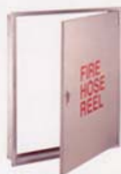
MODEL H HOSE REEL CABINET ARCHITRAVE