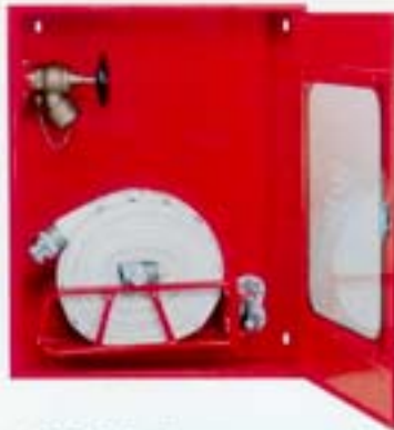
MODEL A HOSE CABINET