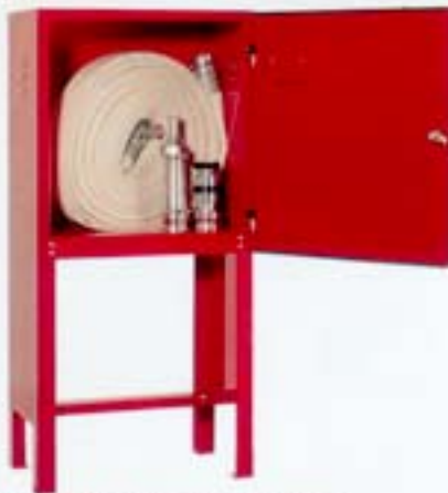
MODEL C HOSE CABINET