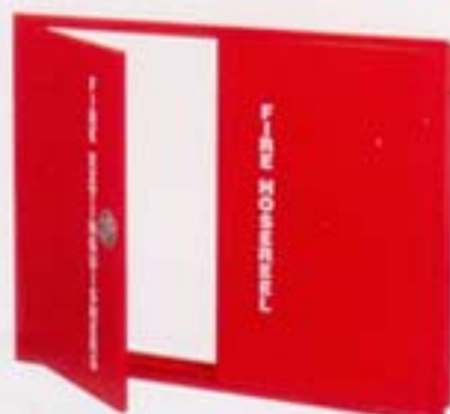
MODEL G HOSE REEL & FIRE EXTINGUISHER CABINET ARCHITRAVE