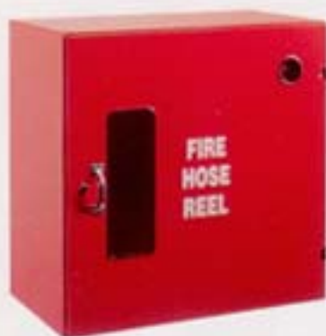
MODEL F HOSE REEL CABINET