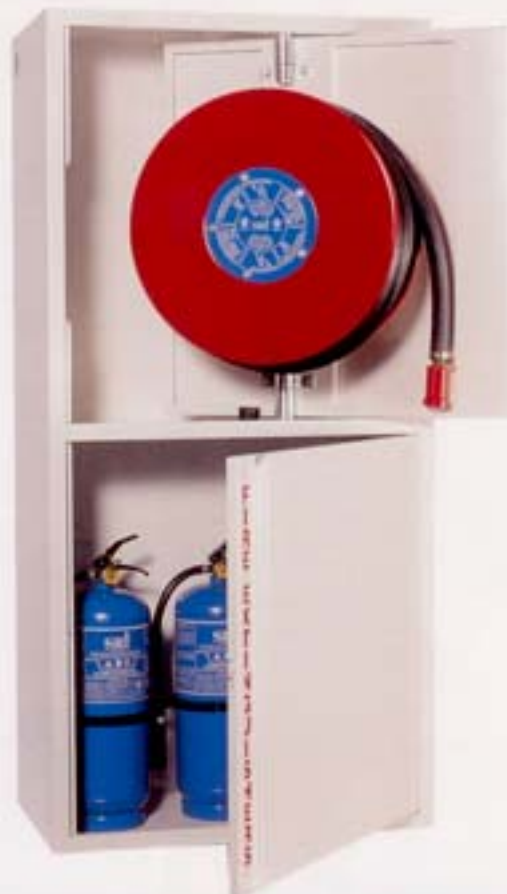
MODEL B DOUBLE COMPARTMENT PIVOT TYPE HOSE REEL CABINET