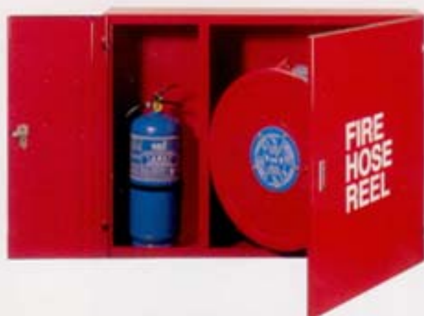
MODEL D DOUBLE COMPARTMENT HOSE REEL CABINET