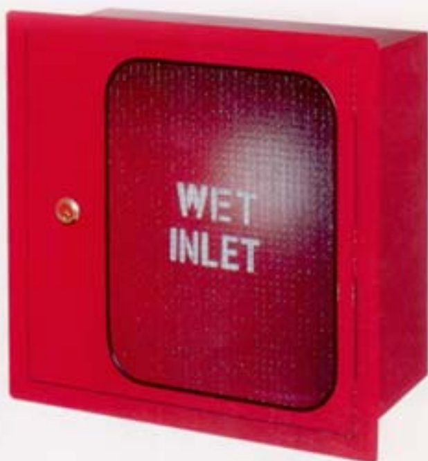
4 WAY BREECHING INLET CABINET