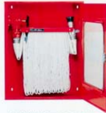
MODEL B HOSE CABINET